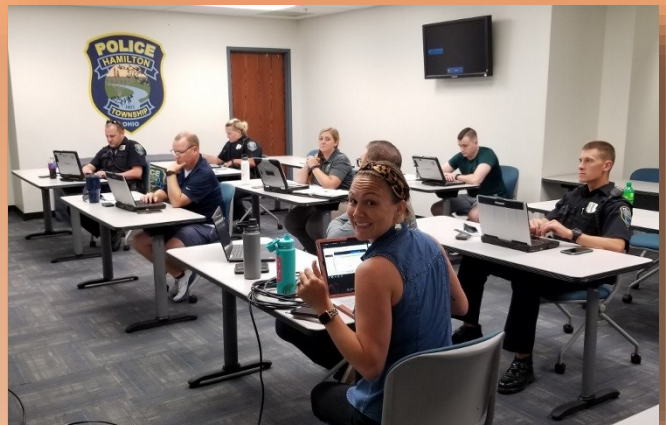
Above: 8/4 Hamilton Twp PD Training