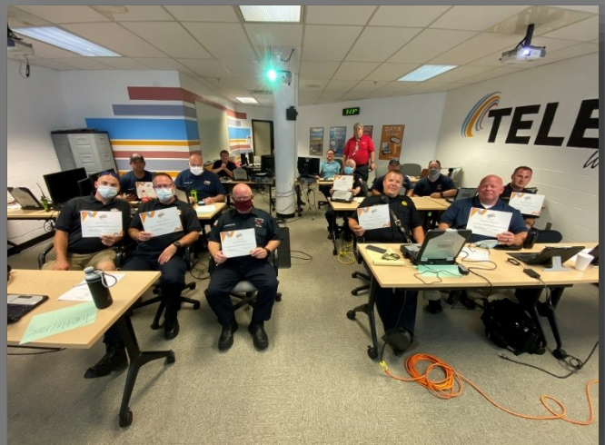
Above: 7/9 Fire Mobile Train-the-Trainer