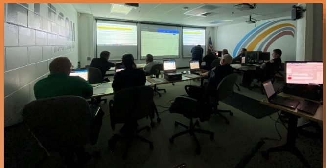
Above: 7/20 Fire Mobile Training