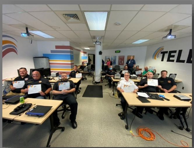
Above: 7/20 Fire Mobile Train-the-Trainer